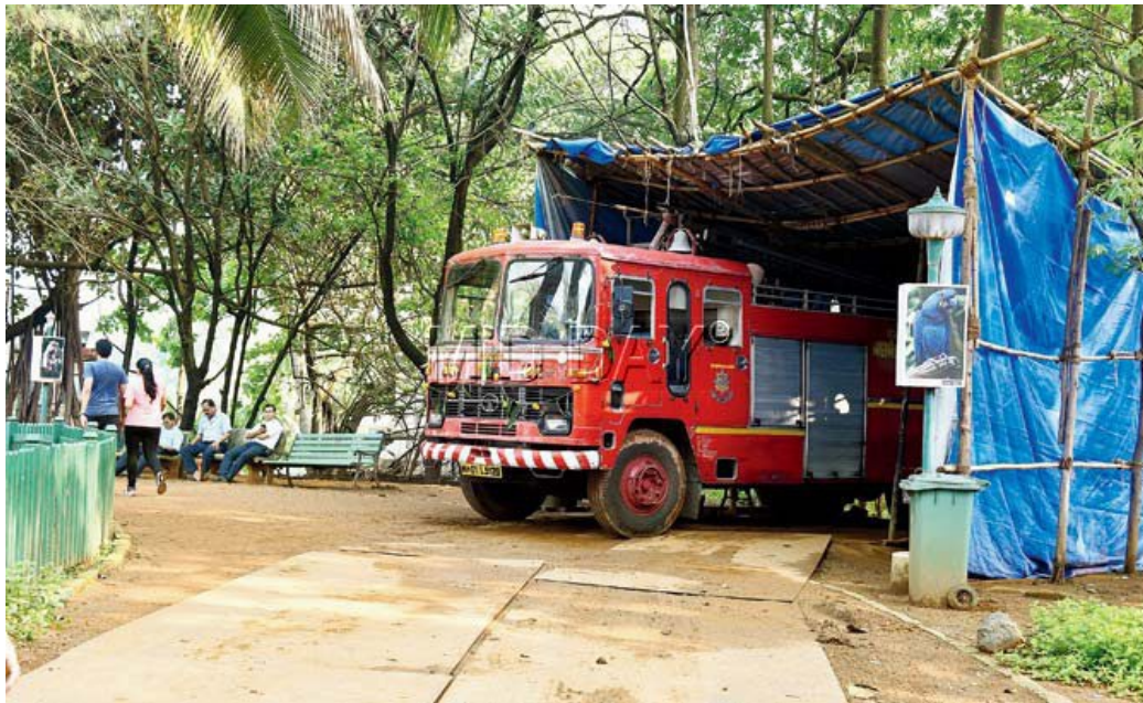
The fire engine stationed inside the park

Dussehra morning's meeting, which saw a large number of SoBo citizens engage in an animated discussion to 'Save the Priyadarshini Sports Complex' at Nepean Sea Road, will resume today, on Gandhi Jayanti, where a definite plan towards saving the park is expected to be chalked out and presented to the citizens for information and action.