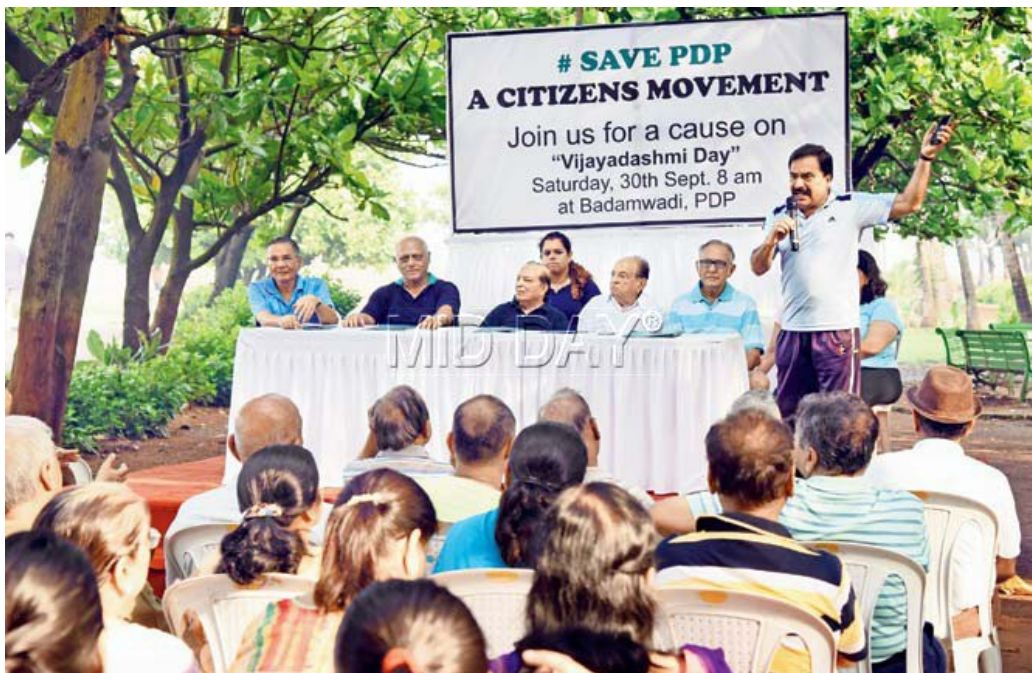
An angry local tells people to come together to save PDP